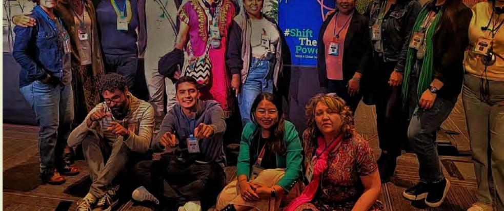
Part of the Alianza delegation at the Shift The Power meeting, in Bogotá, Colombia

The Shift the Power Movement is a global network of organizations seeking to tell a new story for the development of societies in the world - one that lies in the actions of individuals, organizations, and networks rejecting externally imposed solutions and believing that another path is possible, placing people and communities as actors, decision-makers, and investors in their development processes.